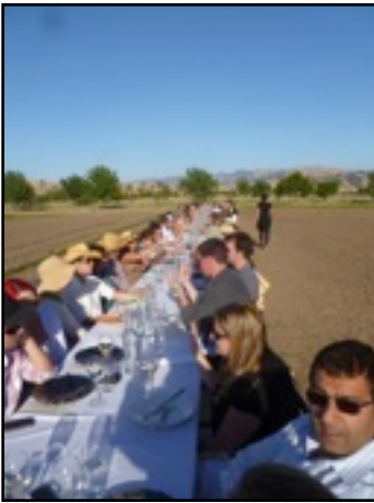
Dinner for 150 new friends with Oliveto and Outstanding in the Field

Giornata was honored to be selected to pour the wine at a 150 person dinner hosted by the Outstanding in the Field organization. Oliveto Restaurant (Oakland, CA) prepared a 4 course meal at Baia Nicchia Farm in the San Francisco Bay Area. A long table was set up on the farm that specializes in growing heirloom Italian vegetables. Oliveto's chef presented four courses paired with wine from Giornata.